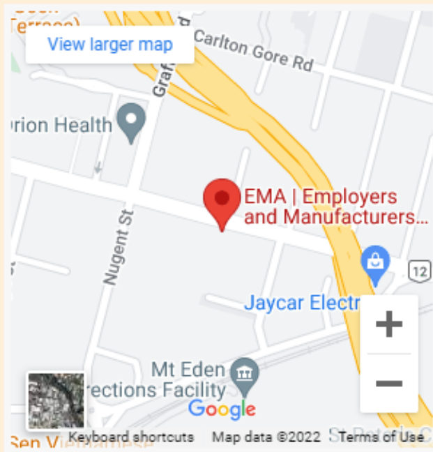
EMA Conference Centre 145 Khyber Pass Road, Grafton, Auckland